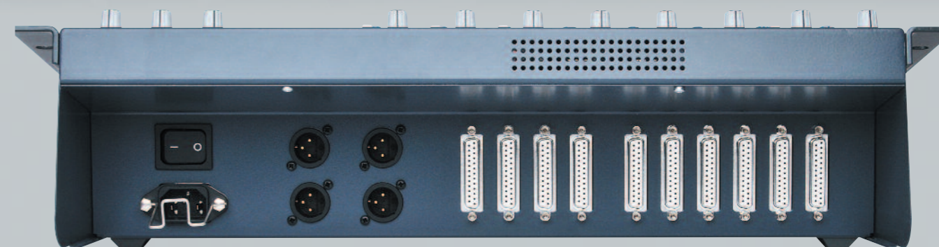
X-Desk rear panel connections. Shown with rack ears fitted.

X-Desk brings benchmark audio performance to the compact mixer format.